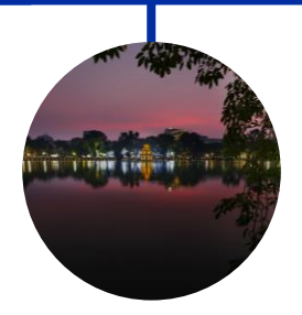
Trung Nguyen Vietnam