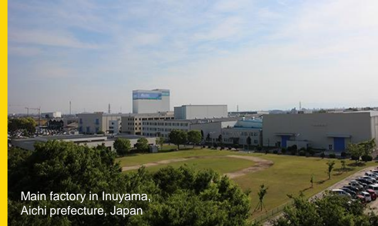
Main factory in Inuyama, Aichi prefecture, Japan