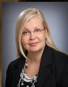
Finance manager, Team Finland co-ordination