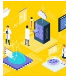
DEVELOPMENT OF CANCER IMMUNOTHERAPY ALGORITHM STARTED