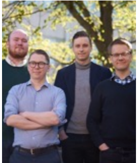
COMPANY FOUNDED AT AALTO UNIVERSITY