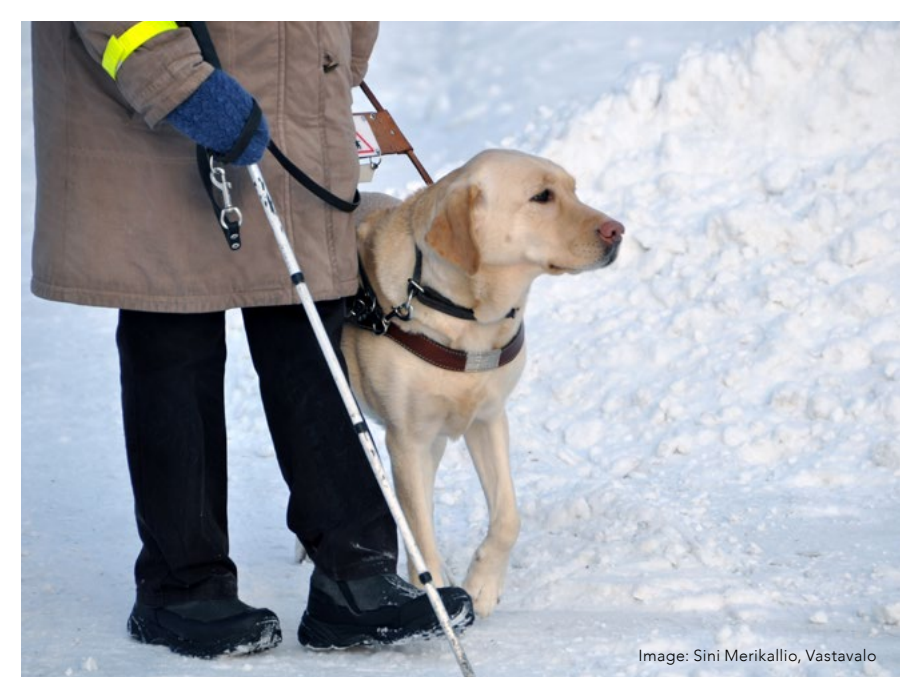
As the name suggests, assistance dogs assist people. They may be able to remove socks, search for items, close doors, switch off lights and even pick up a pin from the floor. Guide dogs guide people by recognising traffic light signals and keeping their human on the sidewalk. Pet bans cannot apply to guide or assistance dogs by law.

People with hearing impairments have some level or type of hearing impairment, from mild hearing loss to complete deafness. People with hearing impairments may use hearing aids or other instruments, such as an induction loop system. Lip reading is also used by some. Hearing aids help their users with communication, benefit quality of life and increase sense of security. Deaf people (and some people with impaired hearing) use sign language, which is usually their mother tongue.