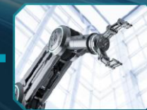
Robotics & Autonomous Systems