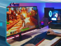
Visual Media and Gaming