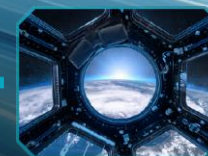
Scientific AI, HPC & Quantum